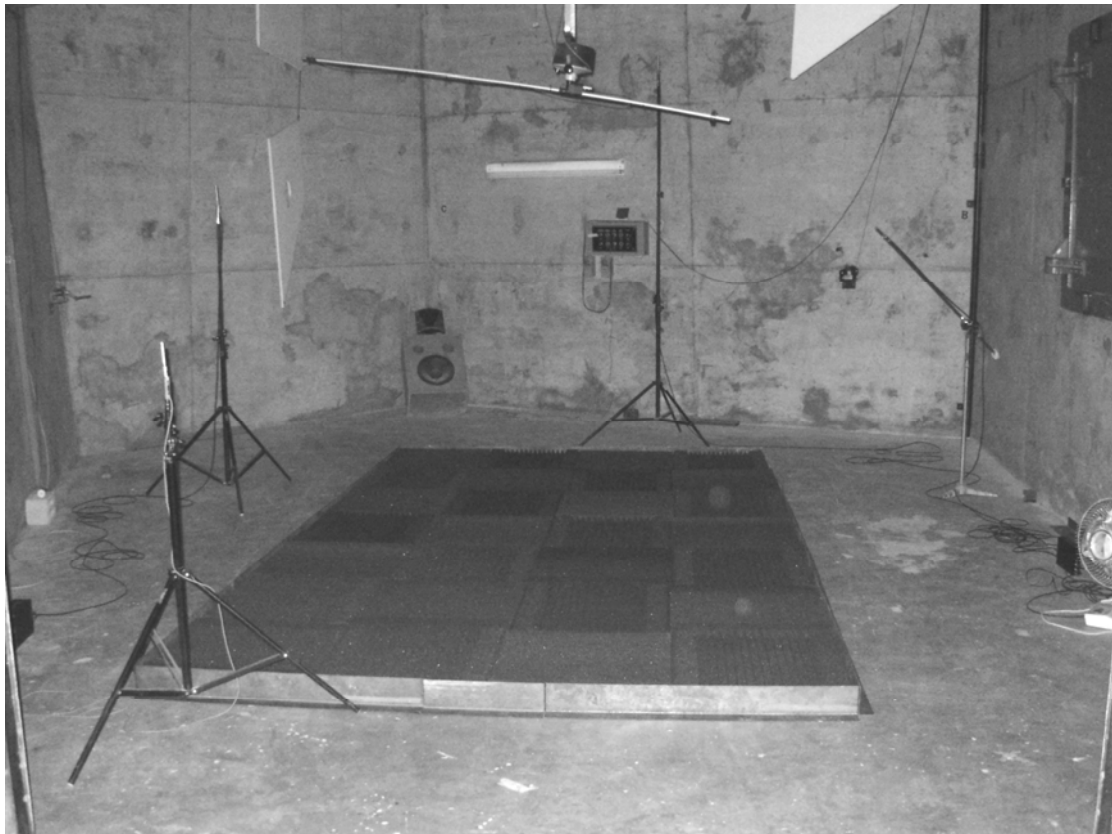
Figure 1: Sample installed in the reverberation chamber.

The tiles were mounted directly on the floor of the reverberation room. The sample tested comprised of 28 tiles laid out in a 4 x 7 array to give a total surface area of 10.08 square metres. The perimeter of the sample was contained by steel edges. Figure 2 shows the sample installed in the reverberation chamber.